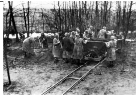
Women as pack animals