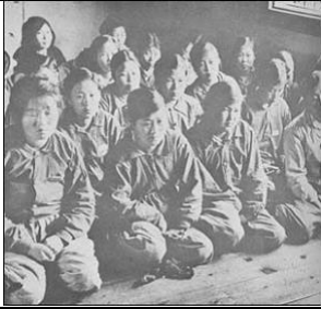
Enslaved 'comfort women'

Women suffered grievously in World War II. The popular icons of the period might reflect the cheerful yes-we-can spirit of Rosie the Riveter, but the truth was much, much uglier: women forced into prostitution; women in hideous prison camps, women forced into hard labor.