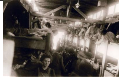
Women in concentration camps